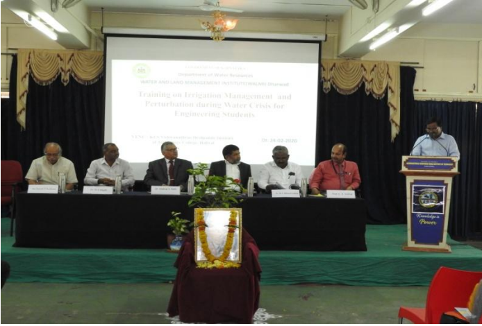
Welcoming the dignitaries

5. "I request the WALMI members to conduct more no of field visits so that the students get to know the practical aspects"- Jyoti (6 th sem)