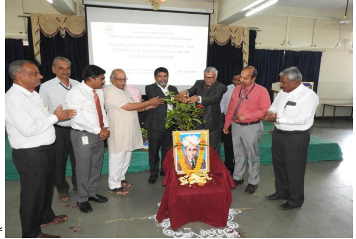
Inauguration by watering the plants