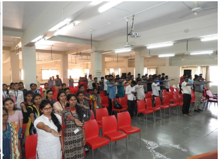
Different sessions followed by oath taking ceremony