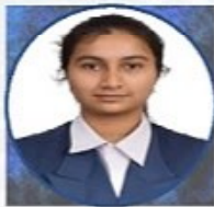
Bhagyalaxmi Computer Science

From Management, Principal, Staff and Students