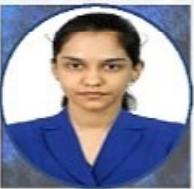
ASHA Computer Science