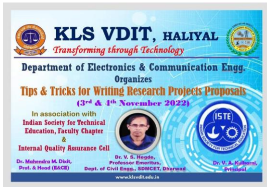
Point No. 1 Flyer