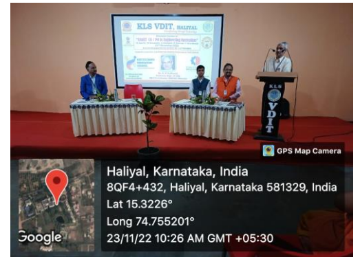
Point No. 3