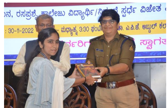
Point No. 4