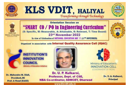
Point No. 3 Flyer