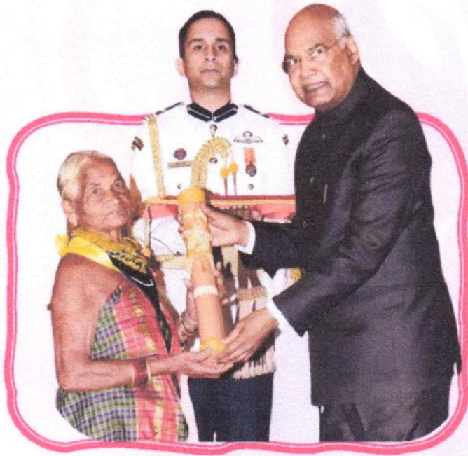
Smt. Tulsi Gowda

Karnataka Rajyostav Award 1999 Padmashree Award 2020